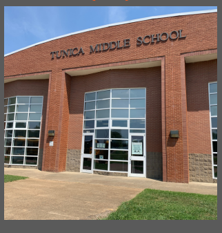
LAUREL CITY (MS)