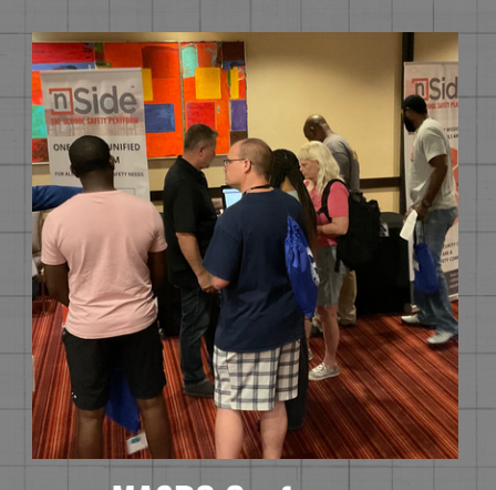
MASRO Conference (Mississippi Association of School Resource Officers) Biloxi, MS (July 2022)