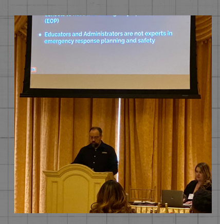
MASS Conference (Mississippi Association of School Superintendents) Biloxi, MS (July 2022)