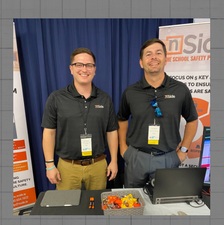
ALET Conference (Alabama Leaders in Educational Technology) Orange Beach, AL (September 2022)