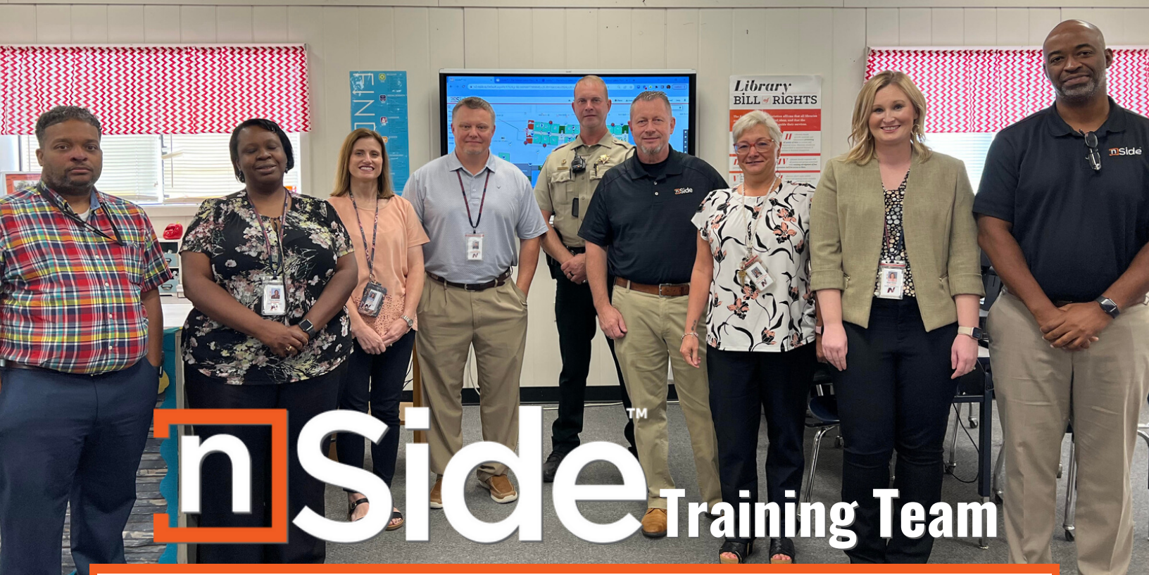
Our nSide Training team working with school leaders at Nettleton School District in Nettleton, MS (September 2022)