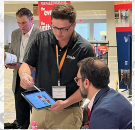
Southern Region Leadership Conference New Orleans, LA (July 2022)