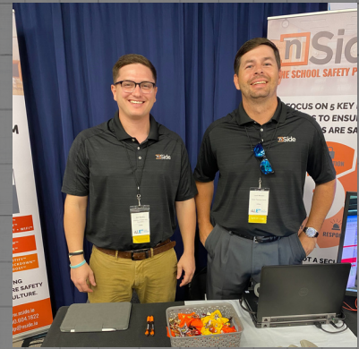
ALET Conference (Alabama Leaders in Educational Technology) Orange Beach, AL (September 2022)