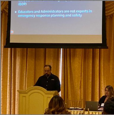
MASS Conference (Mississippi Association of School Superintendents) Biloxi, MS (July 2022)