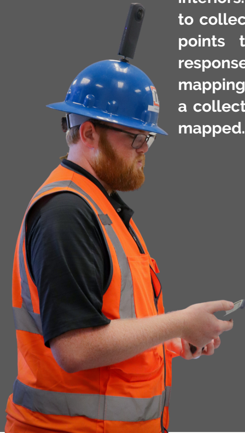
TUNICA COUNTY (MS)

19.5 MILLION square feet mapped in Quarter 3