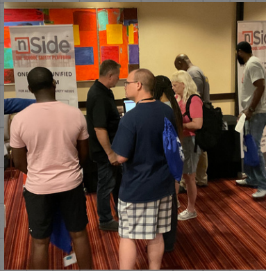
MASRO Conference (Mississippi Association of School Resource Officers) Biloxi, MS (July 2022)