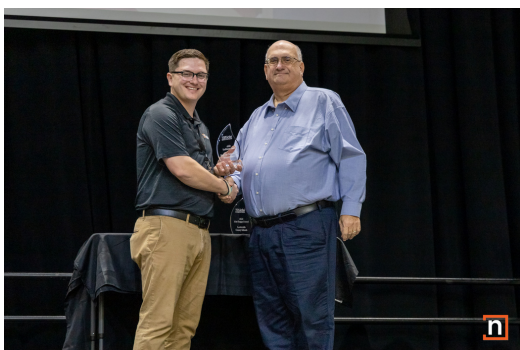
Rossville Consolidated School