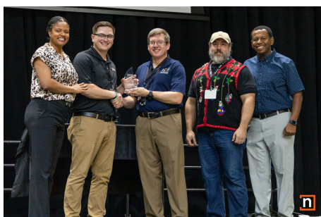
Huntsville City Schools