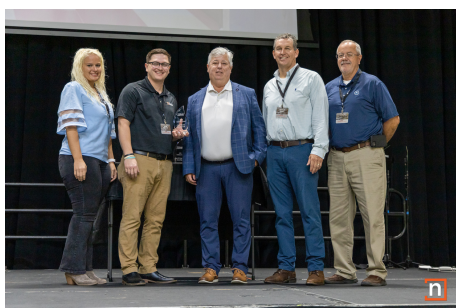
Gulf Shores City Schools

This award is given to districts that have added additional safety modules to their nSide platform or worked with nSide to update their maps and information within the platform. The three districts recognized this year are Huntsville City Schools (AL) , Gulf Shores City Schools (AL) , and Mississippi Schools for Deaf and Blind (MS) .