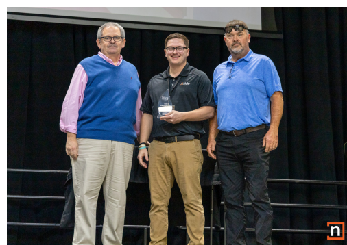
Lauderdale County School District (AL)

The winner of this award is calculated using a measure of regular usage of the Platform through sessions and in-app events as well as a measure of quality for the collective districts' Emergency Operations Plan. This year, Lauderdale County School District (AL) was recognized as the Most Engaged District.