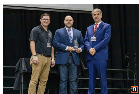
Mississippi Schools for the Deaf and Blind